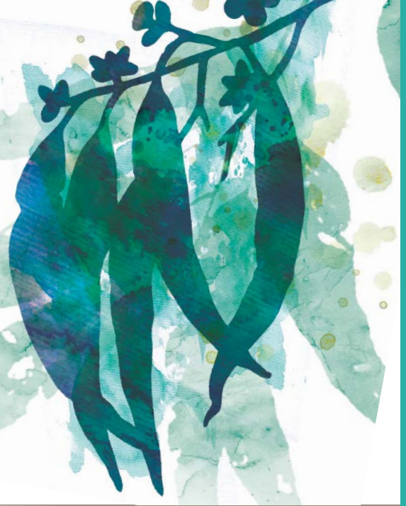
All Manna of Gums Currawong Bush Park to Mullum Mullum Creek Walk